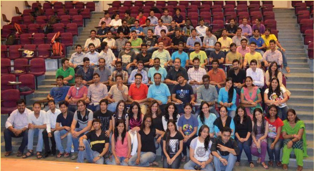
THE FLASH MOB TEAM