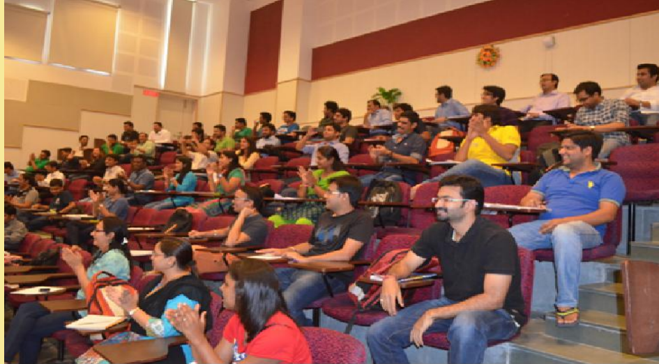
THE PASSING OUT BATCH - MBA(F&B) Batch 6