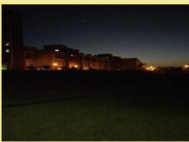
Ayush Bansal B. Tech (2013-17)